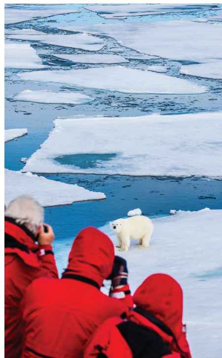
POLAR BEAR, SVALBARD