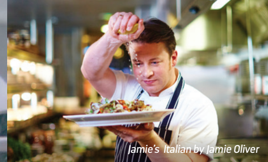
Jamie's Italian by Jamie Oliver