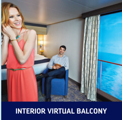
INTERIOR VIRTUAL BALCONY