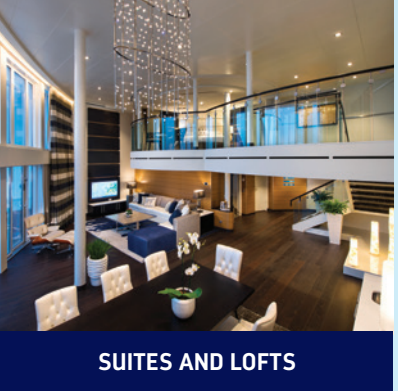
SUITES AND LOFTS